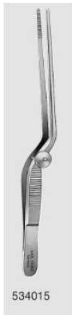
19. Cottle lower lateral forceps, 15 cm (STORZ 534015)