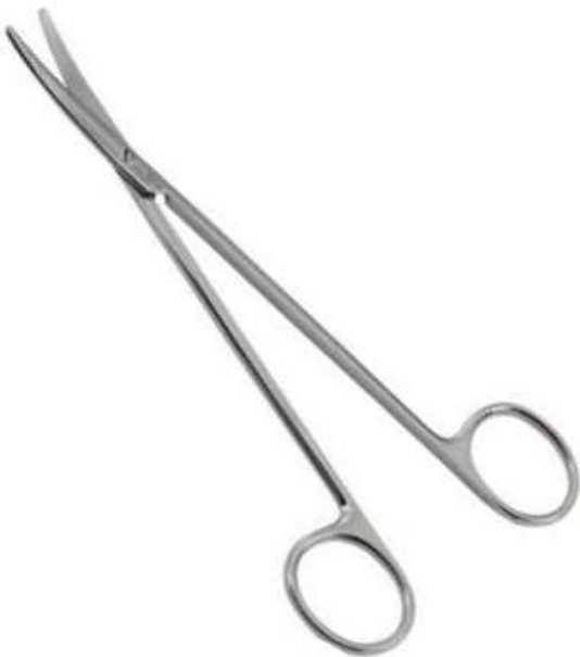
11. Metzenbaum scissors,