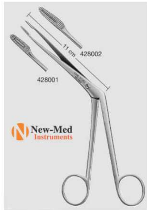
4. 428001 HARTMANN Nasal Dressing Forceps, light model, working length 11 cm 428002 Same, standard size, working length 11 cm