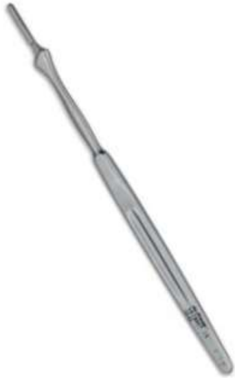
1. Scalpel handle #7