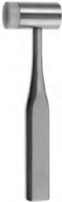
17. Cottle mallet