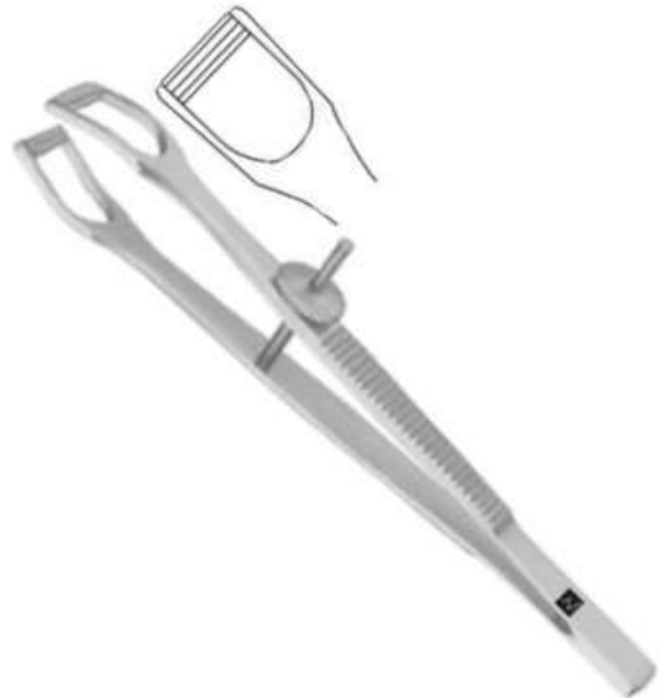
12. Cottle columella clamp