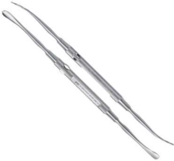
9. Freer Elevator, double end (sharp and blunt blade)