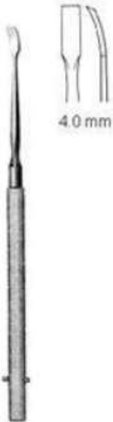
FREER 16.0 cm