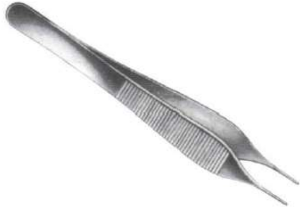
2. Adson tissue forceps (dissecting)