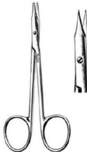
20. Stevens (tenotomy) scissors, straight