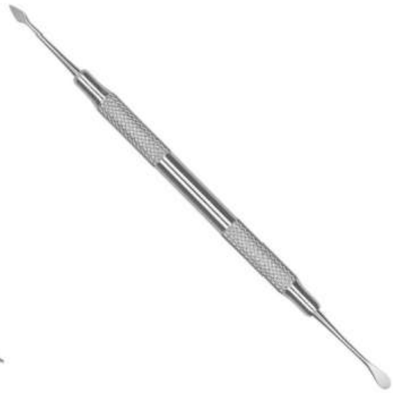
10. Cottle septum elevator